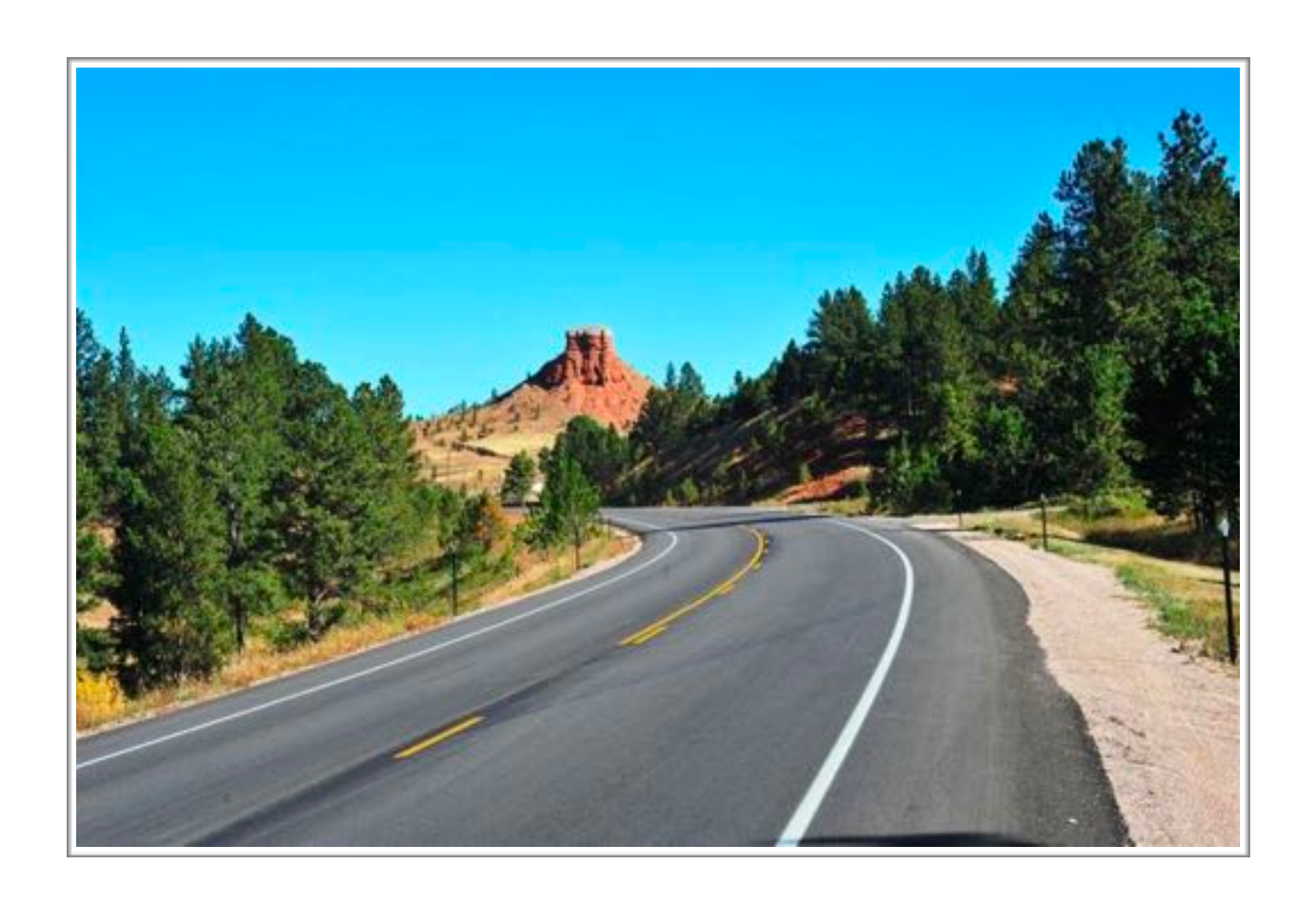
5 Days/4 Nights Gateway City: Laramie, Wyoming